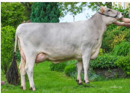
GS DACAPO - M ALICE