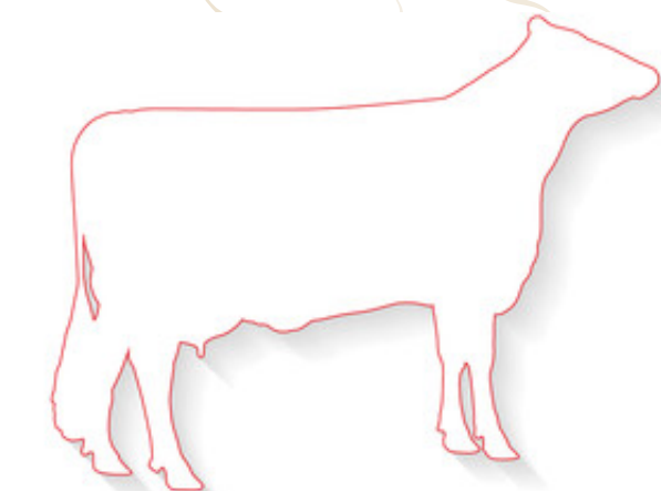
geneticAUSTRIA - SEMEN EMBRYOS LIVESTOCK