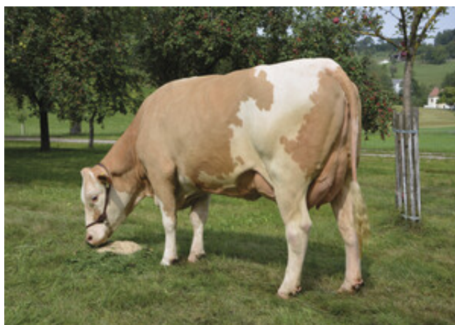
GS WIZZARD - NENA